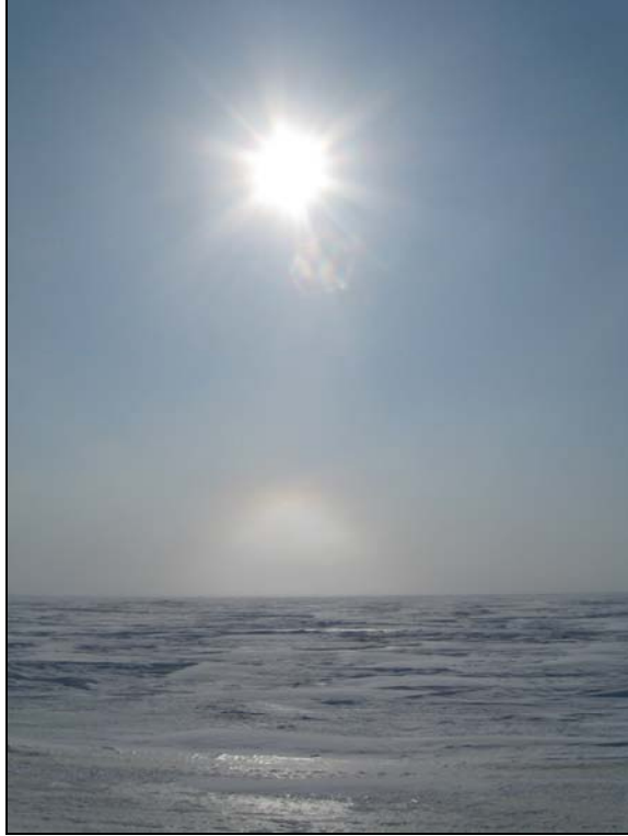
Rondy Ice Road Sundog at L9817