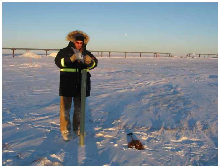
Figure 2. Snow Water Equivalent measurement at Mine Site B by D. Reichardt