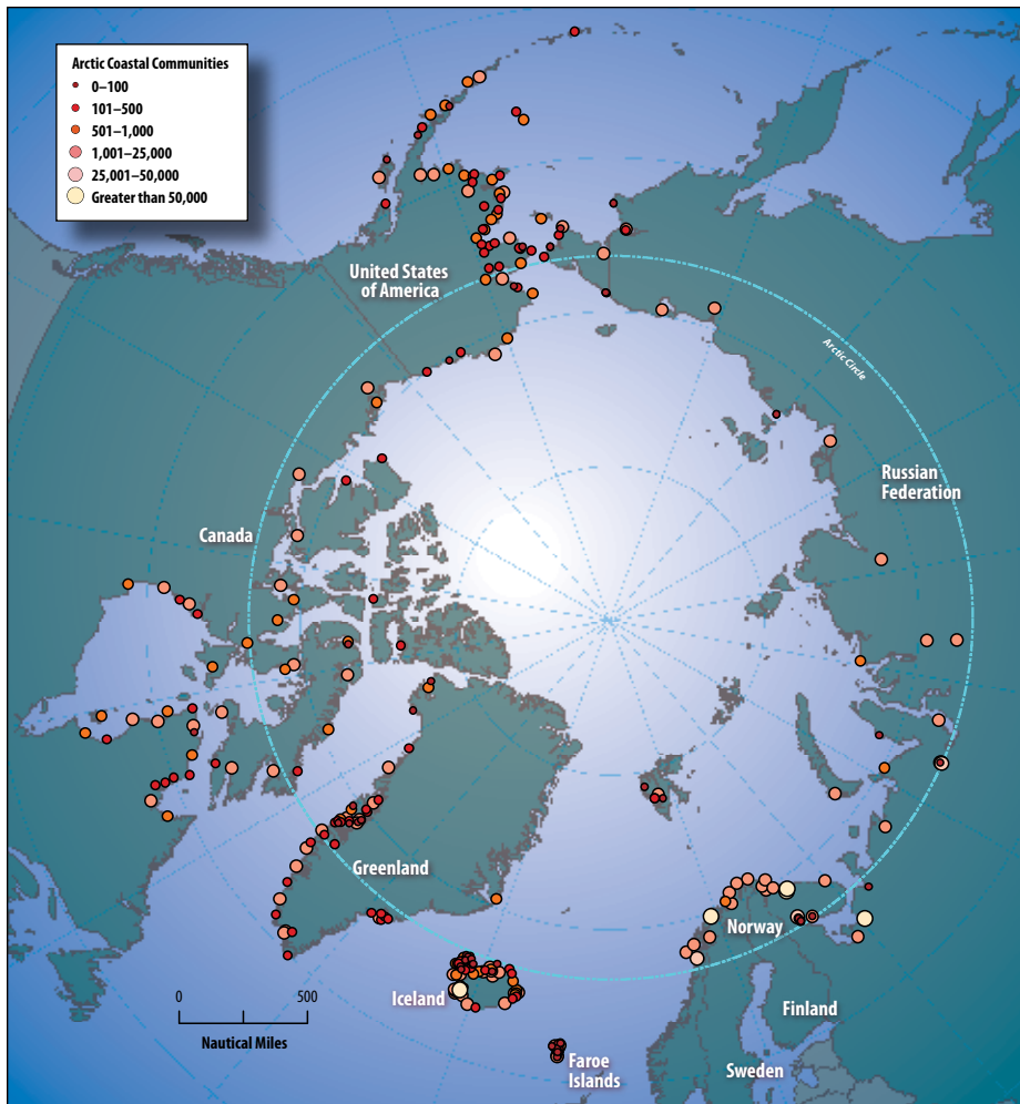
Map 7.1 Circumpolar coastal human population distribution.

Economically, more shipping may increase trade or lower costs for Arctic communities, while increased resource development can provide employment and income for Arctic residents and regions.